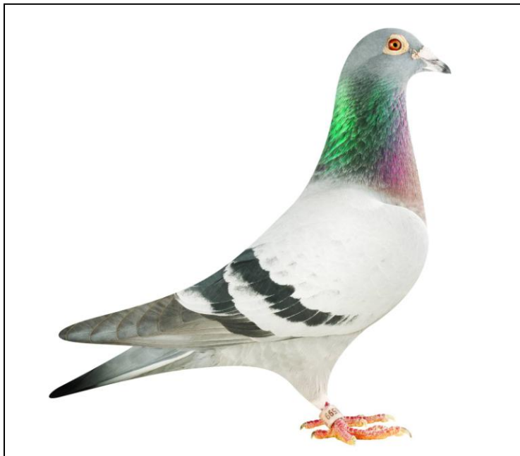
BE 13-6096599 'ENGELS 599'