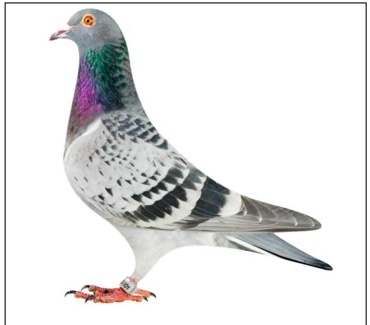
NL 15-1230904 'DANIELA'