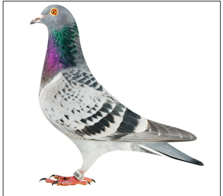
NL 15-1230904 'DANIELA'