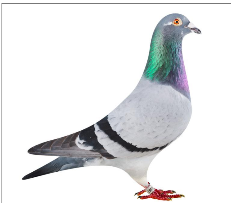
NL 20-4753982 'COBY'