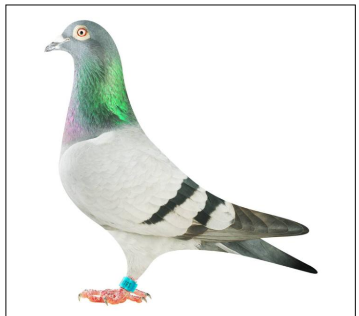
NL 16-4784182 'MANU'