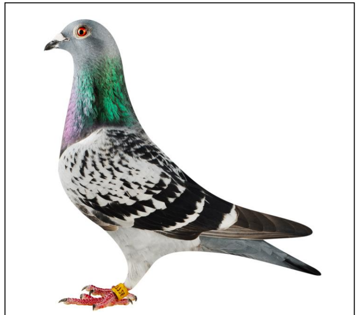
NL 19-4737726 'SIFAN'